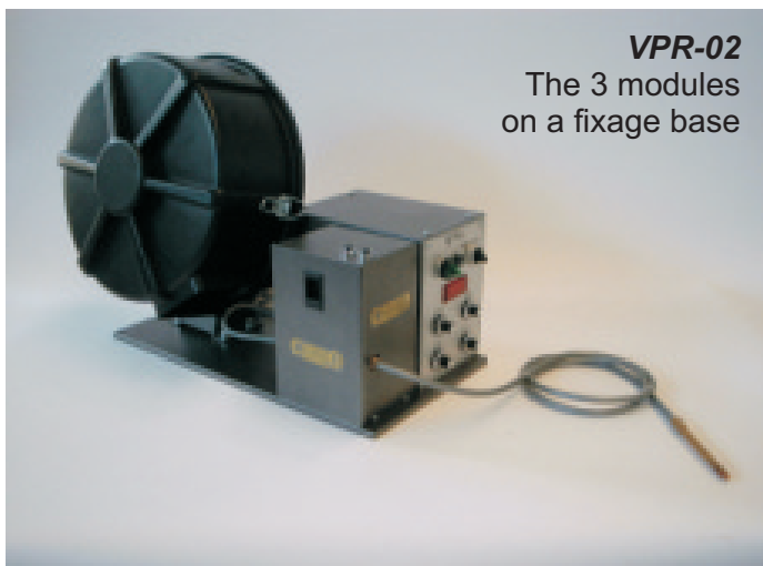
VPR-02 The 3 modules on a fixage base