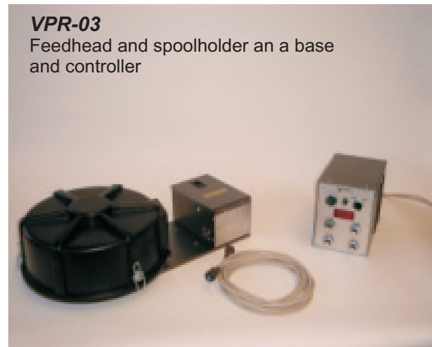
VPR-03 Feedhead and spoolholder on a base and controller